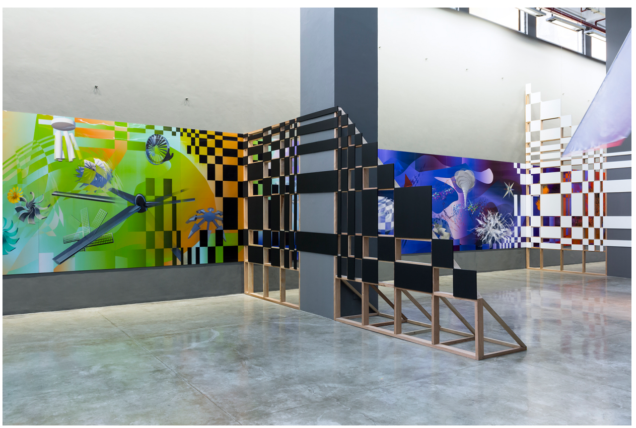
View of The Fantastic Warp and Weft of a Tropical Depression , 2020 and Whirlwind Structure at the Museum of Contemporary Art and Design (MCAD) Manila.