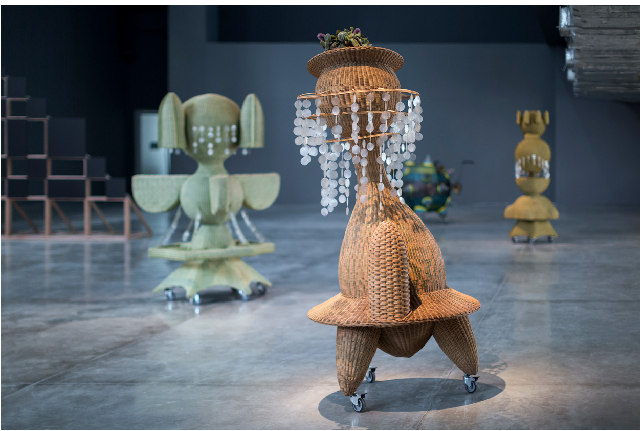
View of three of the The Randing Intermediates–Inception Quartet , 2020 and The Randing Intermediate–Sea Alienage Fanned-out Bang , 2020 at the Museum of Contemporary Art and Design (MCAD) Manila.

For hi-resolution images, visit: http://bit.ly/MCADCoCPressKit