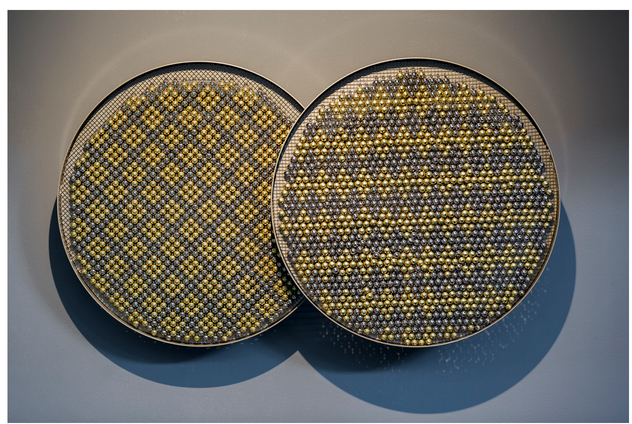
View of Sonic Rotating Identical Circular Twins–Brass and Nickel Plated #1, 2020 at the Museum of Contemporary Art and Design (MCAD) Manila.