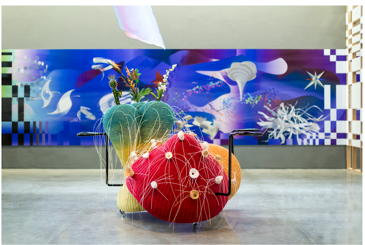
View of The Randing Intermediate–Earth Alienage Rising Sporing , 2020 in front of a part of The Fantastic Warp and Weft of a Tropical Depression , 2020 at the Museum of Contemporary Art and Design (MCAD) Manila.