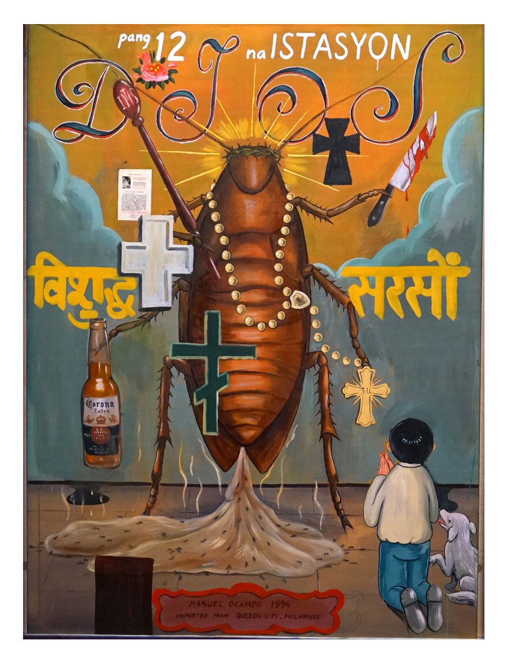
Manuel Ocampo Twelfth Station, 1994 Oil, acrylic, collage on canvas 173 x 127 cm